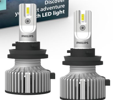
Package includes 2 LED bulbs